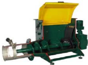
Cut-away sectional view of revolution™ 400 series compaction unit showing patented screw and spring loaded compression cone.