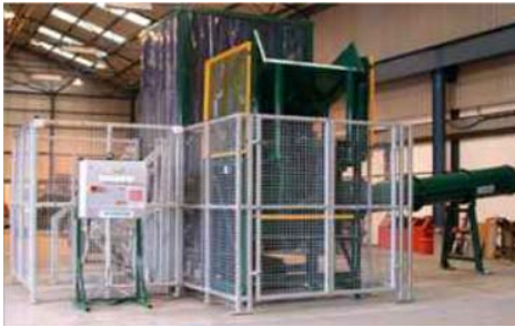
Complete revolution™ 2000 series system installation with control panel, safety guarding, pallet tipper and lift equipment

Processors are currently available in three sizes with custom options to satisfy specific end-user requirements such as enlarged hoppers, bin-lift and pallet tipper feed apparatus.